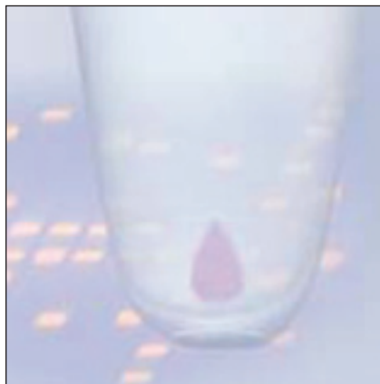
Novagen® Pellet Paint Co-Precipitant image used in the VGN Microarray Outreach Lab Manual