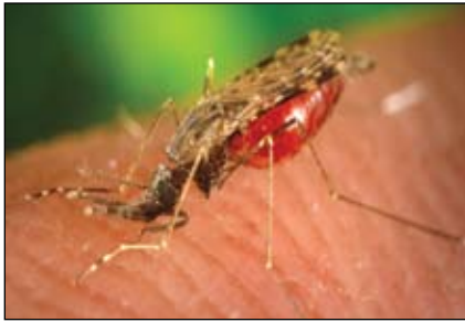
A female Anopheles albimanus mosquito feeds on a human host, becoming engorged with blood. A. albimanus is a vector of malaria, predominantly in Central America.

EMD Chemicals – Novagen – Madison, WI USA